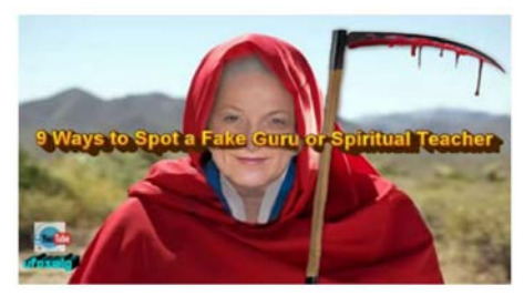
Nine ways to spot a fake guru.

You can help spread the truth by circulating these messages across your mailing lists and social media contacts.